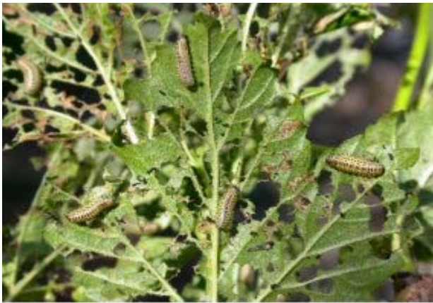
Mature larvae on skeletonized Viburnum leaf.